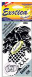
EXOTICA ICE® PT1-XXL-ICE