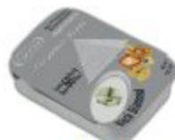
BLACK DIAMOND TSC24-DIA