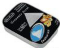
EXOTICA ICE® TSC24-ICE