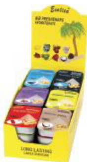
TSC24-MX 24 pcs / Display 144 pcs / Case Available in MIX or 1 Fragrance / Case