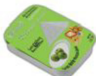
GREEN APPLE TSC24-APL