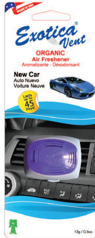
New Car EXV-NCR