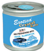
New Car CRY-NCR