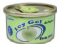
GREEN APPLE EG24-APL