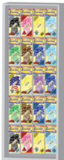
SK20 SIDE KICK 20 HOOKS 1 DISPLAY / CASE 41 1/2" x 14" x 4 1/2" (DISPLAY ONLY)