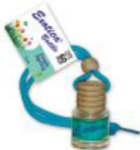
FRESH SPRING EBOT-SPR