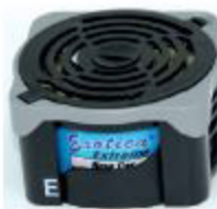
NEW CAR XTR-NCR