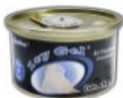
EXOTICA ICE EG24-ICE