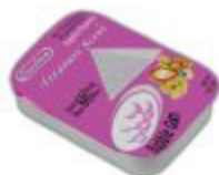
BUBBLE GUM TSC24-BUB