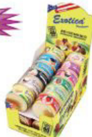
ESC24-MX 24 pcs / Display 144 pcs / Caso Available in MIX or 1 Fragrance / Caso