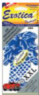
NEW CAR PT1-XXL-NCR