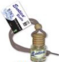
EXOTICA ICE EBOT-ICE