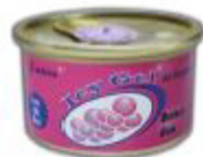
BUBBLE GUM EG24-BUB