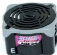
BUBBLE GUM XTR-BUB