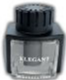
EXOTICA ICE® ELG-ICE