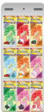
CB9 CARDBOARD DISPLAY 9 HOOKS (65" X 26") (DISPLAY ONLY)