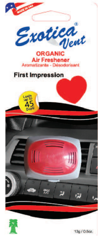
First Impression EXV-FIR