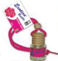
BUBBLE GUM EBOT-BUB