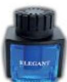
NEW CAR ELG-NCR