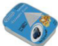
NEW CAR TSC24-NCR