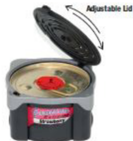
24 pcs / Case 1 Fragrance / Case