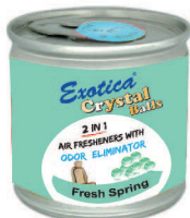
Fresh Spring CRY-SPR