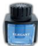
Inspired by COOL WATER ELG-CWT