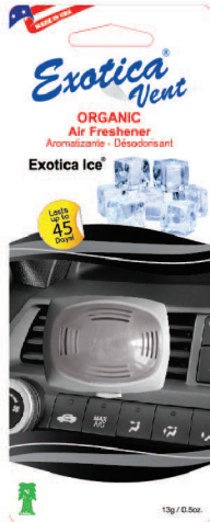
Exotica Ice ® EXV-ICE