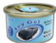
NEW CAR EG24-NCR