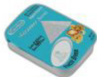
FREEZE BREEZE TSC24-FBZ