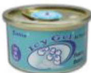
FREEZ BREEZE EG24-FBZ

EG24-MX 24 pcs / Display 144 pcs / Case Available in Mix or 1 Fragranza / Case