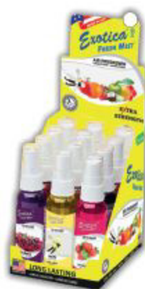
FM2-MIX 12 pcs / Display 144 pcs / Case Available in MIX or 1 Fragrance / Case