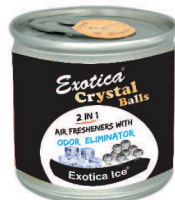
Exotica Ice ® CRY-ICE